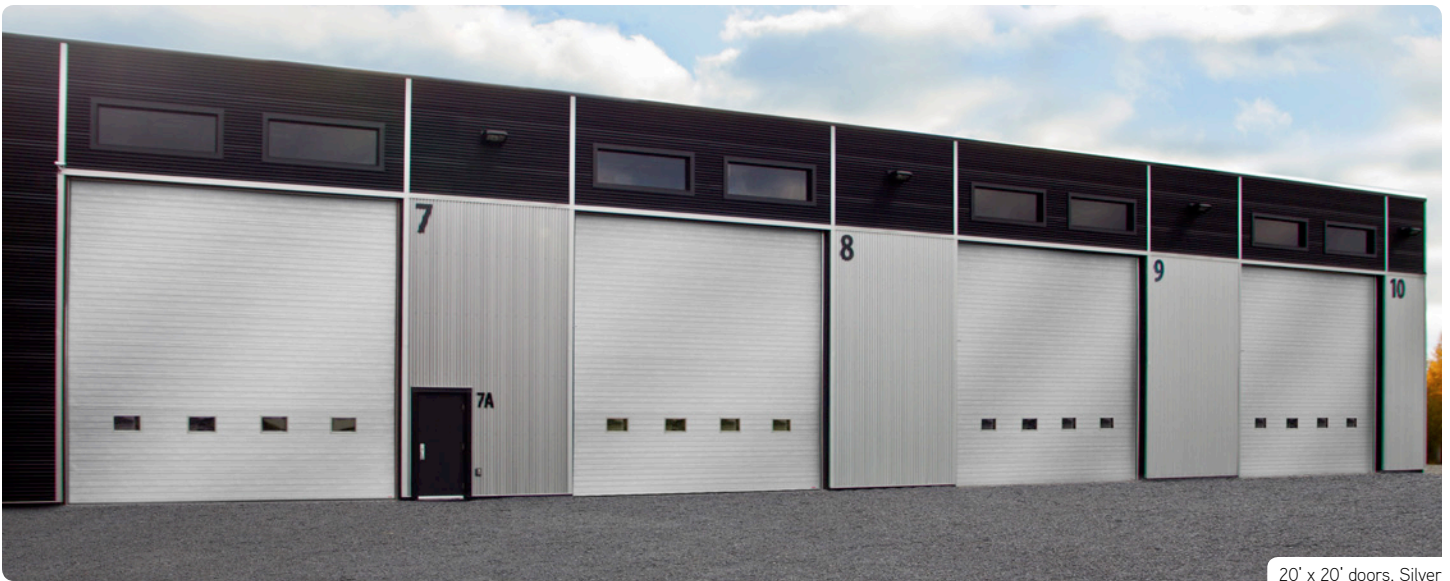
20' x 20' doors, Silver